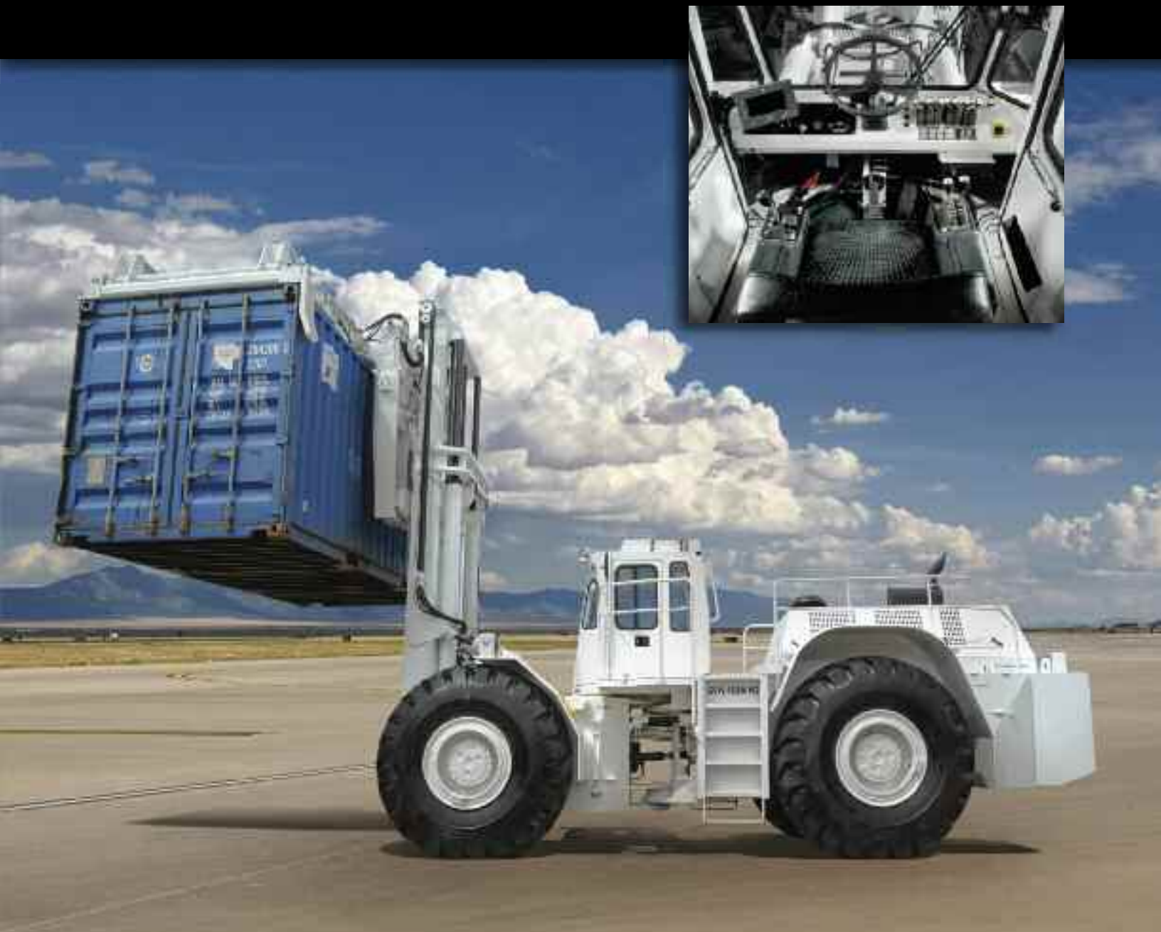
Container Handler/Forklift | Diesel, Articulating.

The 25TCH, with hydraulic spreader or fixed handler, can stack containers 3-high and has water-fording capability up to 1.5 meters.