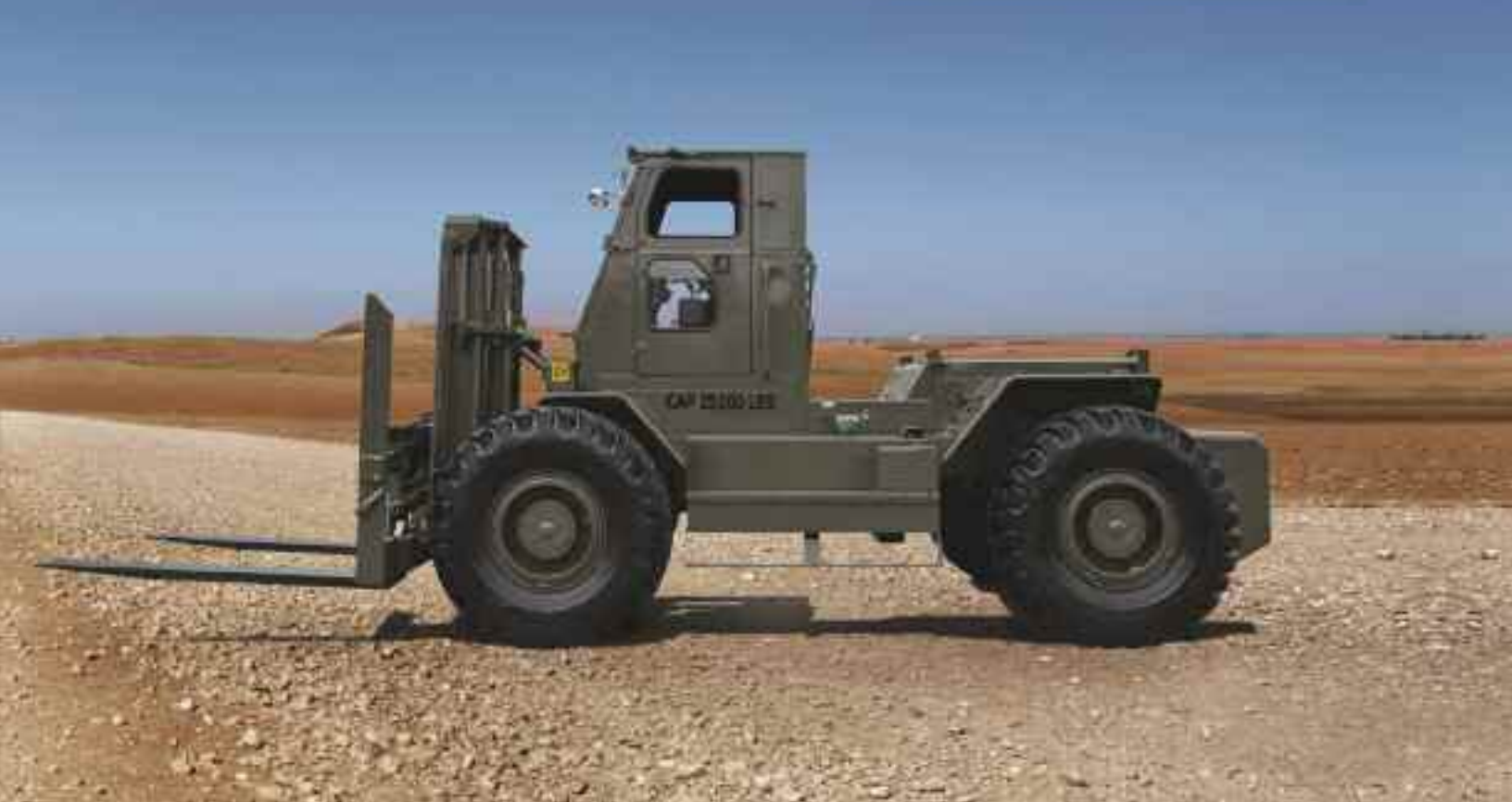
Rough Terrain Forklift | Diesel, 4WD, 4WS.